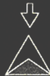
Electrical Merkaba Spiral Rotates Clockwise

The natural merkaba has specific ratios for the magnetic and electric which is more electrical than magnetic which involves a higher frequency, less dense, self-perpetuating eternal, christos The inorganic, nnnatural merkaba , is self-consuming, finite, anti christiac.