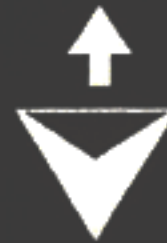
Magnetic Merkaba Spiral Rotates Counter-clockwise